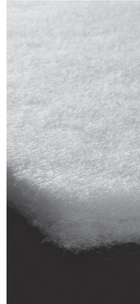
Filter Values (Acc. to EN 779)